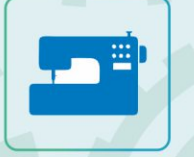
Sewing Machine Industries