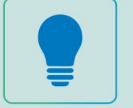
General Light Services