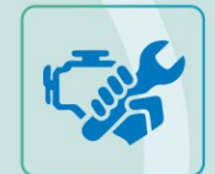
Auto Parts & Components