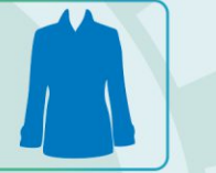
Apparel & Accessories