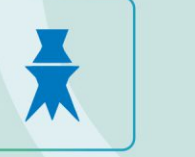
Jewellery & Gold Plating