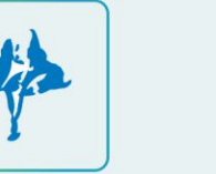
Cotton Ginning & Spinning