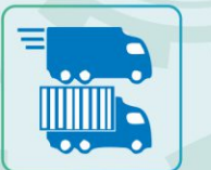
Logistics & Warehouses