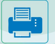
Printing & Stationaries