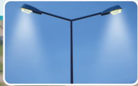
SOLAR LIGHTS ON ROAD JUNCTIONS