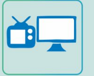
Electronics & Computer