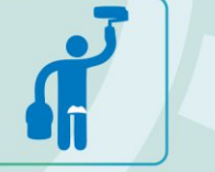
Paint-shop for Automobile